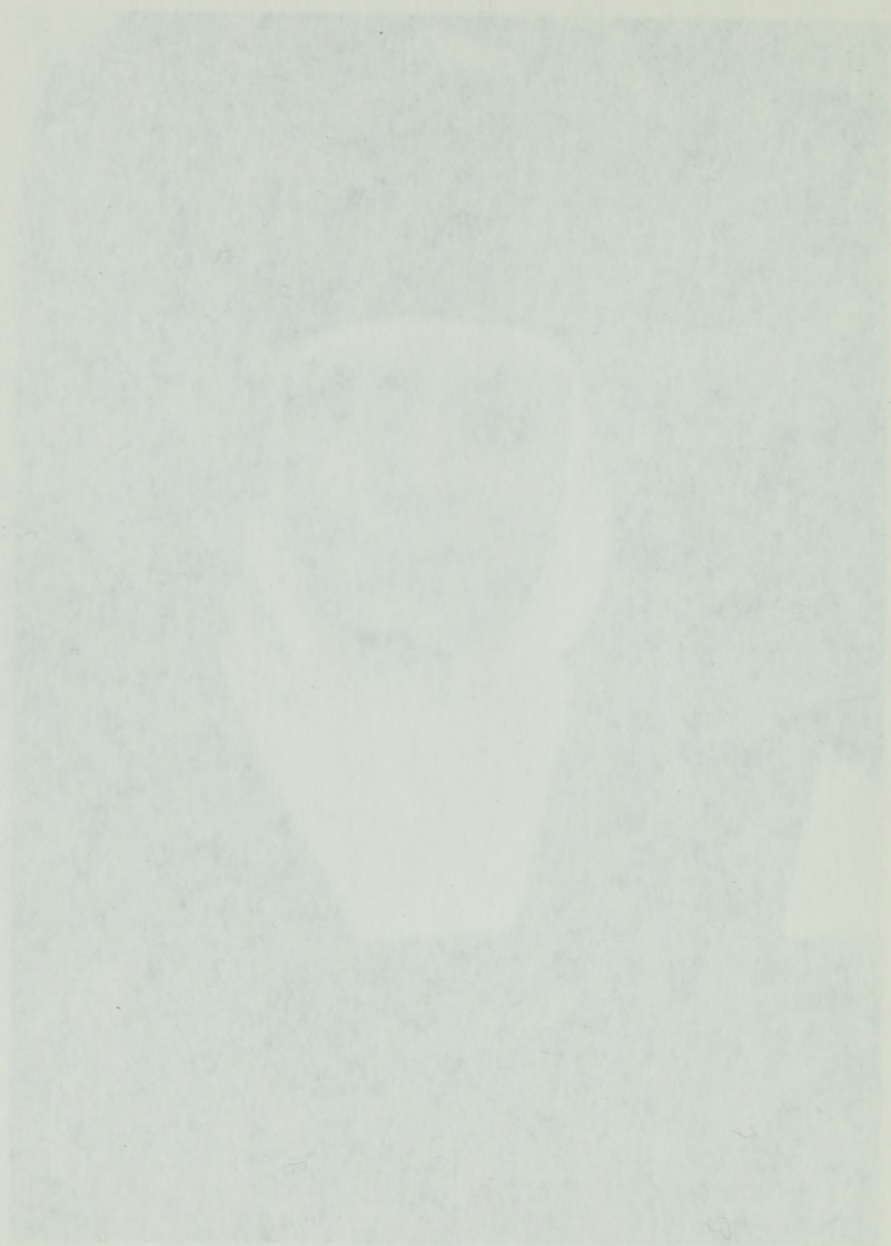
The Hon. Mr. [Name] of the [Institution]